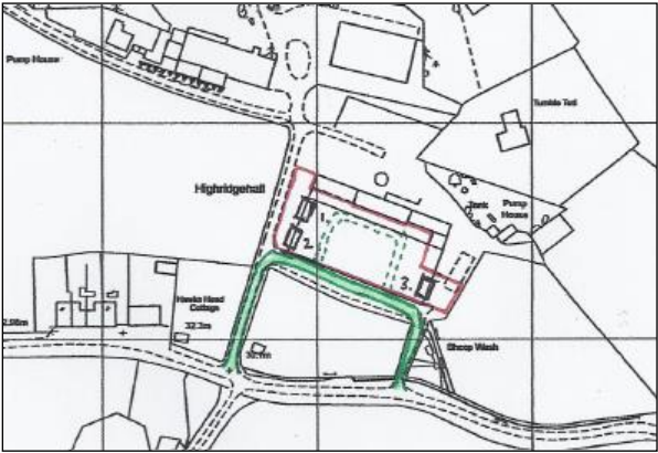
Arrangement of new-build plots